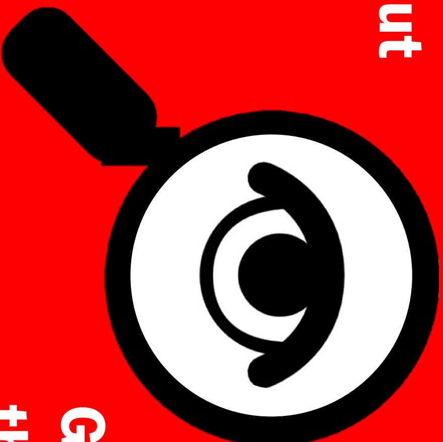
Figure out what matters most